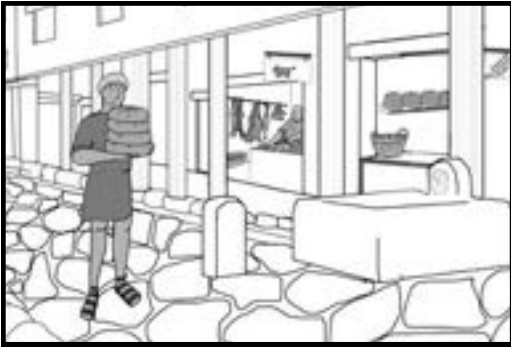
pistor baker in via in the street