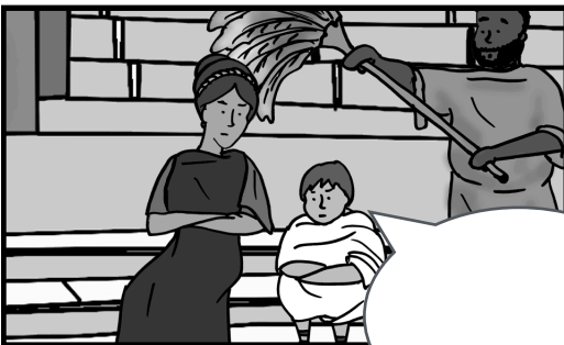
vexat bothers sedes seat