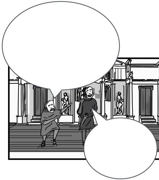
hic this (man) miles soldier gloriosus famous pulcher- rimus most beautiful optimus best adulator flatterer